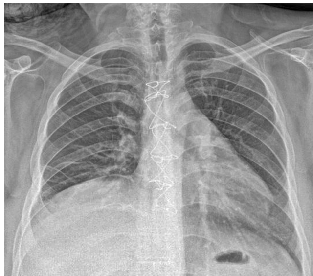
Figure 3: Control X-ray upon discharge of the patient without evidence of pleural effusion, without data of mediastinal widening, with sternal fixation.

After said management, the hospital's average number of postoperative days was 22.65 \pm 15.6 . As previously mentioned, there was no statistical difference between