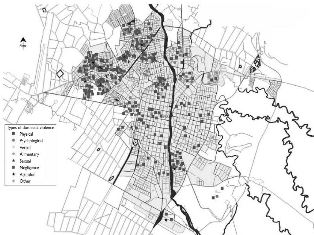
FIGURE 2. TULUÁ, LOCATING CASES OF DOMESTIC VIOLENCE. 2004

As a result of the project, all the observatories currently use geo-referenced systems that allow them to locate and intervene in cases of violence. For example, during the implementation of the observatories, the number of reports of domestic violence increased in Tuluá, as shown by the maps identifying cases. This mapping proved to be one of the most useful tools in our work (figure 2). In Tuluá, as a result of the mapping, local authorities created new centers for the attention of those affected by domestic violence, including extended hours of attention up to 24 hours and during weekends.