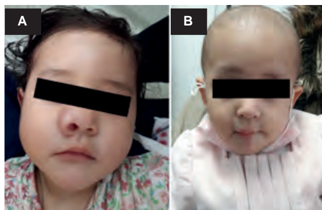
Figure 1. A. Right nasal ala mass, indurated, with partial obstruction of the lumen in the nasal vestibule. B. Total mass disappearance 8 months after chemotherapy with Vincristine and Cyclophosphamide. Image taken by the authors with parental consent.

During the physical exam, a mass with a rigid and fibrous consistency was observed in the right nasal vestibule, arising from the nasal ala and infiltrating the ipsilateral nasal shed, with no bleeding stigmata and no abnormal findings in the oral cavity. Additionally, there was evidence of an 8 mm diameter lymph node enlargement which was palpable, mobile, painless, and non-adherent to the deep planes. Adenopathy located in the right cervical IIb region, which was mobile, painless and was not adhered to deep planes, was evident. No other abnormalities were found during the physical exam (Figure 1A).