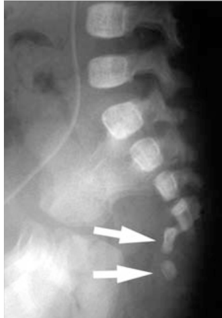
Figure No. 3. Sacral fracture dislocation in an abused two month old girl. Lateral radiograph depicts a fracture between the fourth and fifth vertebrae, through the intervertebral disk space. The fifth sacral vertebra and coccyx (arrows) are anteriorly displaced. The injury was originally explained as resulting from a changing table fall; the mother's boyfriend later confessed to slamming the child down in a sitting position.