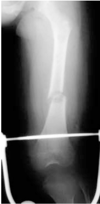
Figure No. 2. Femoral shaft fracture in an abused five year old boy. Frontal radiography shows a transverse fracture of the diaphysis in femoral pin traction. The mother's boyfriend confessed to pushing a television cabinet on top of the boy.