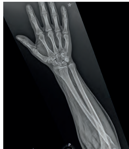
Figure 1. Right hand X Ray. Subcutaneous emphysema