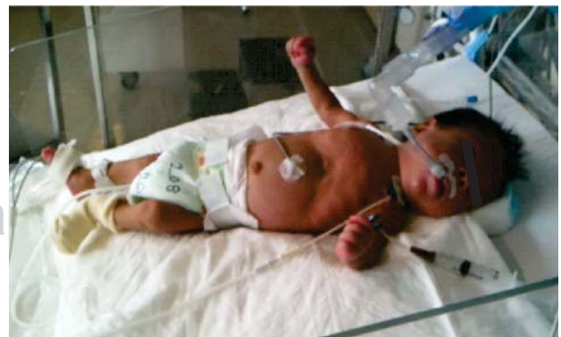
Figure 1. Three-month-old male with Ohtahara syndrome with mechanical ventilation.

However, BS in EMT is generally most evident during the sleep state, making EEG recordings during sleep to be of great importance for diagnosis. It must be emphasized that BS in EIEE is found from the beginning only in limited cases (generally disappearing at 6 months), whereas BS in EMT is found persistently in all cases, even after 1 year of age and up to the end of follow-up. 1