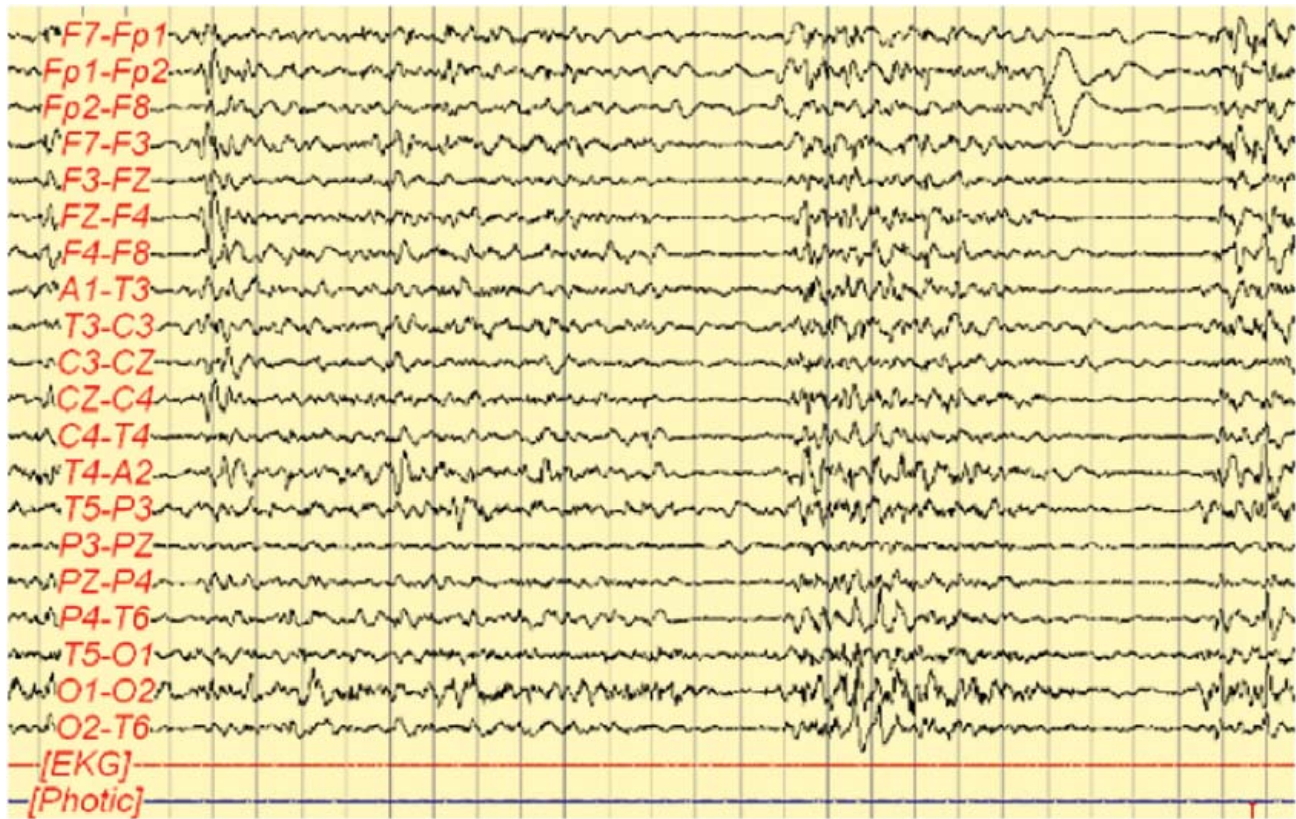
Figure 3. Electroencephalogram with burst-suppression pattern.