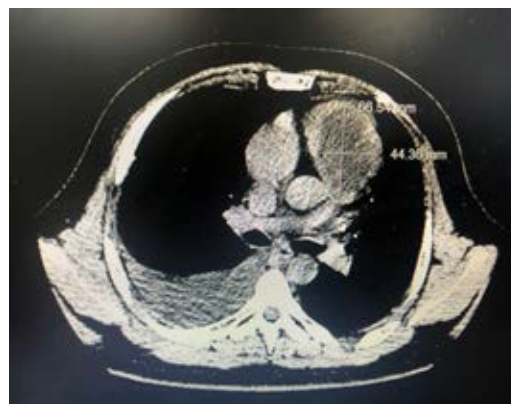
Figure 4: Thorax computed tomography scan demonstrating right ventricular mass.

and cardiac magnetic resonance (CMR), is very important to establish the extent of disease and better characterize the tumor. 6