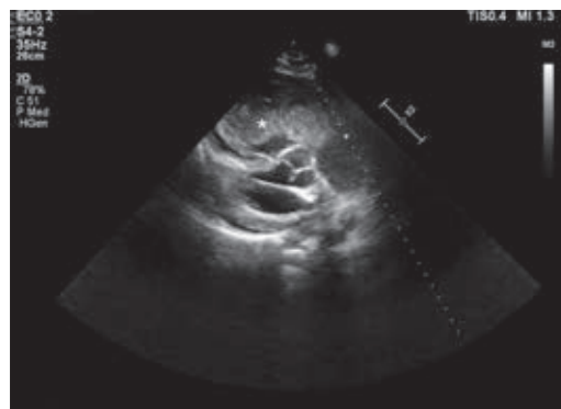
Figure 3: Parasternal long axis revealing huge mass in the right ventricle compressing the left ventricle.