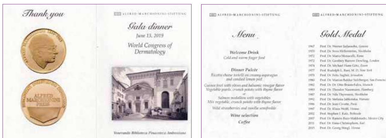
Figure 1 a & b. Gala Dinner, June 13, 2019, XXIV World Congress of Dermatology. Venue, Gold Medal recipients 1967-2015, and the Gold Medal recto & verso.

in the historical venue, the Veranda Biblioteca Pinacoteca Ambrosiana in Milan (figure 1a & b).