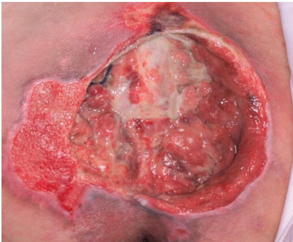
Figure 3. Ulcer showing a reduction of fibrinous-necrotic tissue.