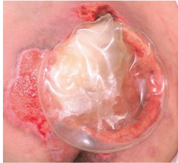
Figure 2. Application of a natural biomembrane dressing.