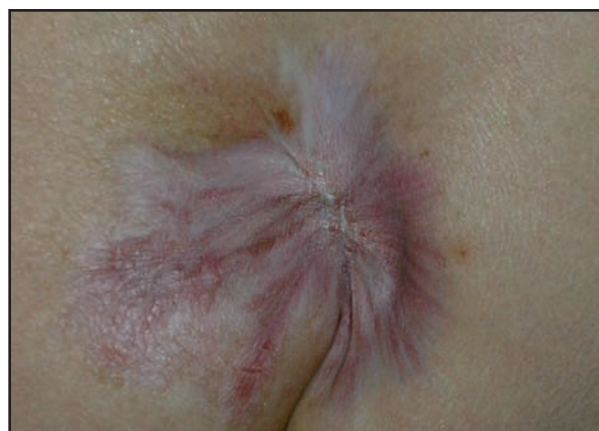
Figure 7. Scar level with the skin and total re-epithelialization of the ulcer after 6 months of treatment..