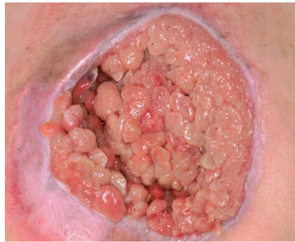
Figure 4. Filling of the cavity with exuberant granulation tissue reaching the skin margin after two months of treatment

measuring 5.6 x 6.4 cm on the left and 6.6 x 8.0 cm on the right (Figure 8), both about 3 cm deep. The ulcers had a clean bottom and no necrosis or signs of infection and were submitted to various anti-sore treatments without a satisfactory response.