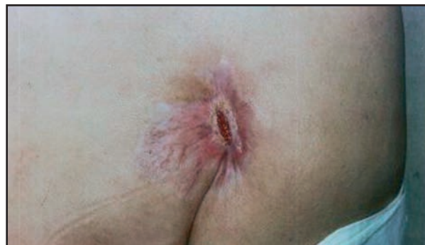
Figure 6. Reduced ulcer size after 5 months of treatment.