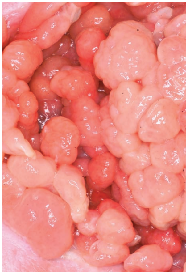
Figure 5. Close up view of granulation tissue.

The authors report two cases of pressure ulcers of chronic evolution that had not responded to various treatments until they were submitted to dressings with the biomembrane.