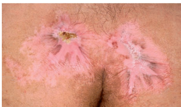
Figure 10. Full ulcer healing without retraction or bulging after 4 months of treatment with the natural biomembrane.

The natural biomembrane favored intense exudation at the beginning of treatment, an event that appears to be related to its action on vascular permeability, facilitating rapid wound debridement, as visualized by the reduction of necrosis and fibrin (Figure 2).