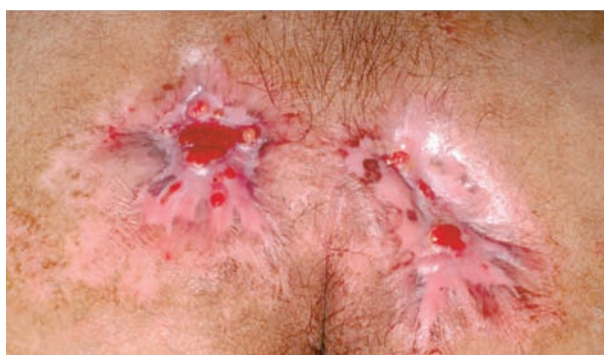
Figure 9. Filling with granulation tissue accompanied by re-epithelialization of the ulcers after two months of treatment with the natural biomembrane.