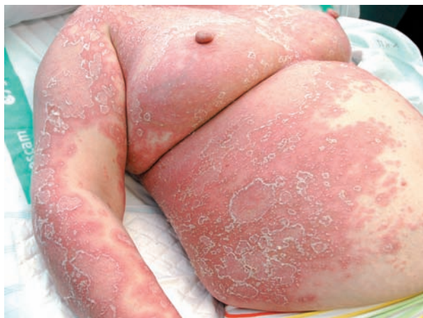
Figure 1. Generalized erythematous-edematous plaques with sterile pustules.

plaques, some of them with a ring-shaped arrangement, on which there were multiple sterile pustules (Figure 1). The more developed lesions had a desquamative centre with pustules on the edges of the plaque (Figure 2). Psoriasiform erythematous desquamative plaques on her scalp and at the nail level, thickening of the plate, ridging and limited oil droplets were also observed. There was no evidence of an effect on mucous membranes or of the presence of geographic tongue which are normally associated to this form of psoriasis.