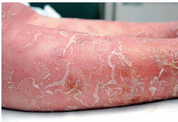
Figure 2. Detail of the pustules.

Supplementary tests showed leukocytosis with left shift and an elevation of acute phase reactants, the remaining hematological and biochemical parameters being normal. The blood cultures, chest X-ray and serology for hepatotropic viruses and HIV, as well as the Mantoux test, were normal or negative. The biopsy of one of the lesions confirmed the presence of subcorneal psoriatic spongiform pustules (Figure 3).