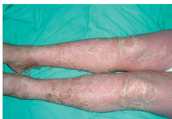
Figure 4. Resolution of lesions after treatment with etanercept.

Irritant substances, drugs, infections, contraceptives, pregnancy, hypocalcemia, lithium, coal tar and the suspension of oral corticotherapy have been described as pustular outbreak triggers (2). In this patient, the cutaneous symptoms