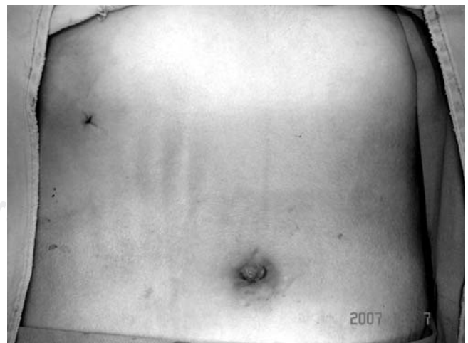
Figure 6. Better abdominal cosmetic results after TUES cholecystectomy.