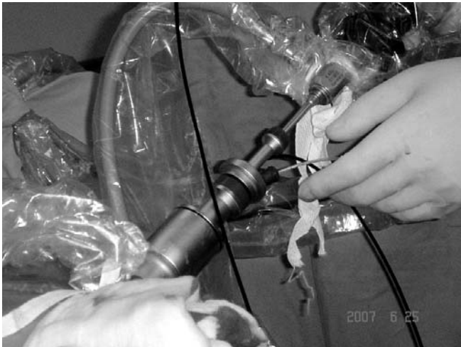
Figure 1. The tri-channel trocar is placed through the umbilical incision. A 5mm laparoscope and two flexible instruments are inserted into the working channels.

From May 2007 to February 2008, 41 cases of TUES procedures were performed in our hospital. There were 18 men and 23 female with a mean age of 46 years (range: 18-65), which include 3 cases of liver cyst, 2 bloody ascites, 10 chronic appendicitis and 26 gallbladder diseases (22 gallstones and 4