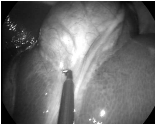
Figure 2. The semi-rigid hook is used to dissect the cystic duct.