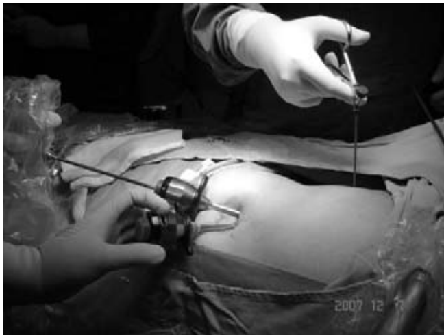
Figure 5. The two 5 mm trocars placed along the infra-umbilicus incision and the mini grasper inserted on the right upper abdomen.

Since the limitation exists in NOTES, TUES may be another option in trying scarless abdominal surgery. Single port transumbilical appendectomy has been described in literature. Usually a rigid laparoscope with a working channel was used in this technique. The appendix was pulled out from the umbilical port by the grasper inserted through the channel and removed extracorporeally. 11,12 Cuesta et al. 13 recently introduced transumbilical scarless cholecystectomy for 10 patients with gallstones. Two 5 mm trocars were introduced parallel to each other through an umbilical incision. A 5 mm laparoscope and instrument were used to dissect the gallbladder which was grasped by a 1-mm Kirschner wire introduced at the subcostal line. The author concluded that the umbilicus can be developed as a natural port for performing various operative procedures with better cosmetic result. A rigid instrument may be more easily maneuvered than a flexible one, but the fundus of the gallbladder is fixed by the Kirschner wire according to Cuesta's approach. It would be difficult to dissect the gallbladder by one instrument. Zornig et al. 14 described another hybrid technique, combined transvaginal and transumbilical cholecystectomy for a patient with gallstones. Conventional laparoscopic instruments and technique are used in this pro-