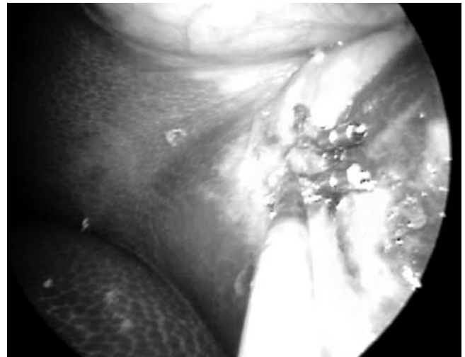
Figure 3. The cystic duct is clipped and dissected by the hook.