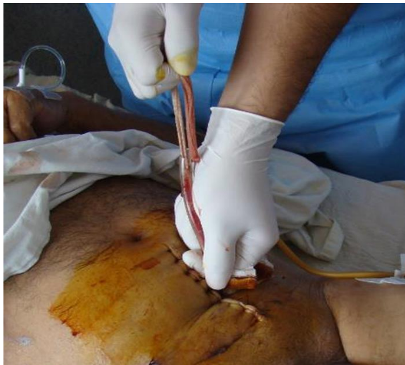
Figure 3. Removal of the packaging with the bandage on the patient's bed.