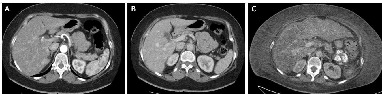
Figure 1. Arterial phase (A) and portal venous phase (B) of a CT scan 8 months prior to admission. The arterial phase displays a patchy appearance of the liver, suspicious for perfusion deficiency. No thrombosis in the venous outflow tract could be identified. C. Portal venous phase of a CT scan on admission shows a marked hepatomegaly and dysmorphic features of the liver. The patchy aspects have disappeared. Neither thrombosis nor stenosis of the hepatic outflow tract were identified.