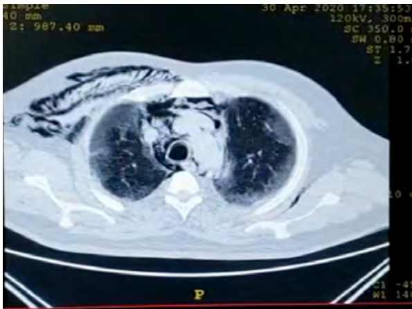
Figure 1. Axial image in standard mediastinal window showing air at the subclavicular and right axillary region. Mediastinum with air in the retrosternal space, aortopulmonary, subcarinal window, and around the trachea.

SP is generally considered a benign disease of clinical importance, with a good prognosis that improves without invasive management [3].