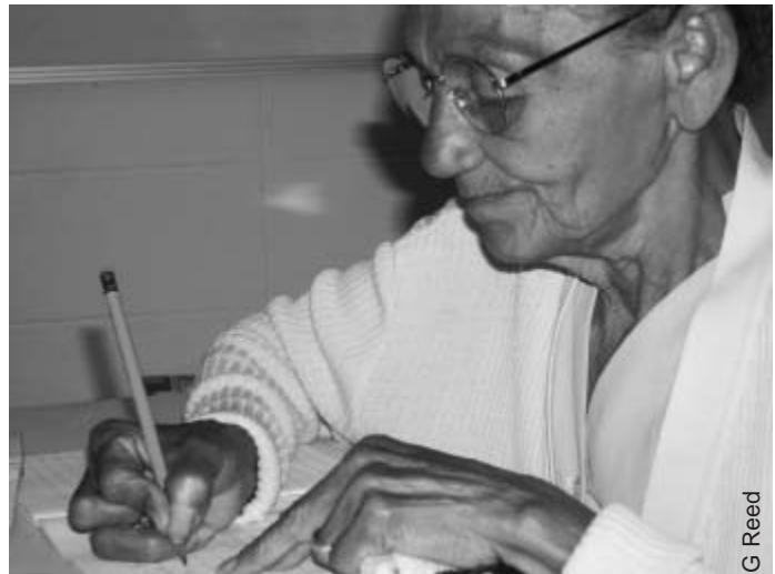
Literacy class in Venezuela: corrected vision a must for seniors

many prospective students couldn't see, thereby remaining beyond the program's reach.[3] Operación Milagro was launched as a result of these findings.