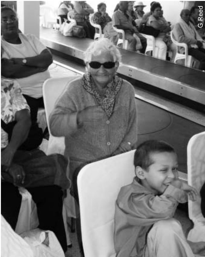
Patients at the Barcelona Airport waiting for flight to Cuba