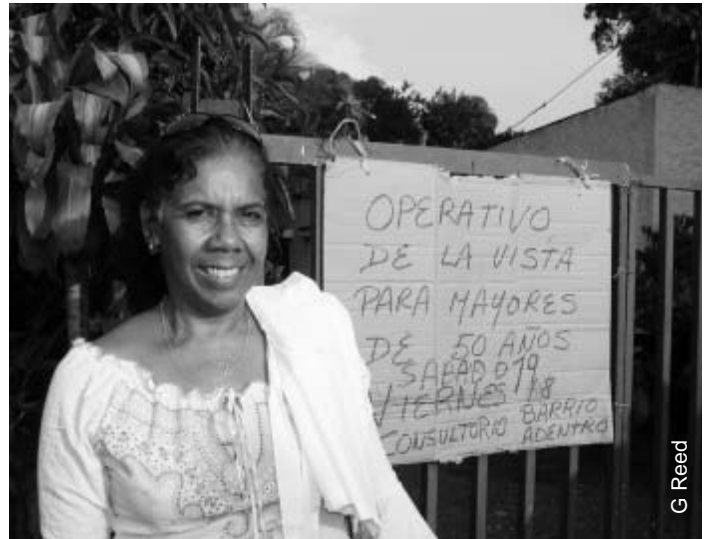
Cuban doctor in Caracas: her sign announces Operación Milagro office hours

Operación Milagro was extended throughout the region, as governments analyzed the program and approached Cuba to participate. The second phase began in 2005, when Caribbean countries including Jamaica, Dominica and St Lucia joined. The scope of Operación Milagro has also developed apace, as more conditions are added to the list of surgeries available, which now