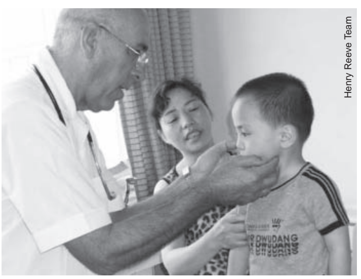
Youngster, mom and Cuban pediatrician in Sichuan hospital, June. 2008.

Acute psychological traumas after an earthquake of that magnitude can last up to six months after the event. When you ask someone about their experience, they will tell you that they saw the ground move under them like a wave and when it stopped they had lost everything. Not just materials things, but their families and loved ones. Some psychologists will tell you that every aftershock is a new trauma for an earthquake survivor. The psychological traumas we saw were so severe that psychiatrists were just as important part of the team as the emergency medicine specialists.