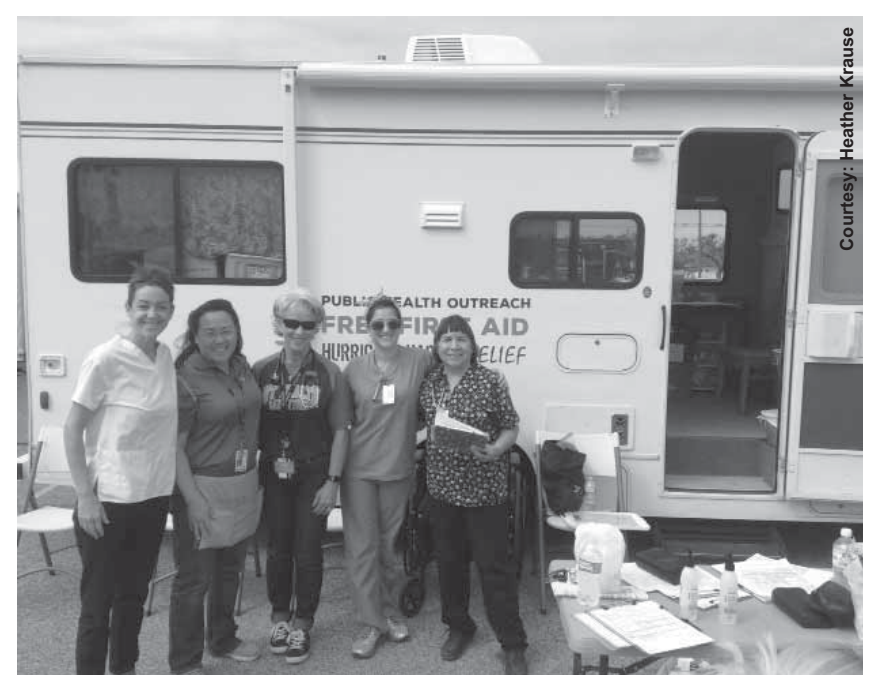
Rockport Strong Mobile Medical Unit, Hurricane Harvey disaster relief.

experience with a doctor or in a health care setting, it can be very hard for them to come back. As a result, their chronic conditions go uncontrolled and we see complications which could have been prevented if they'd had access to a trusted family physician. In Cuba the doctors are very much a part of the community and are sought out for advice and guidance.