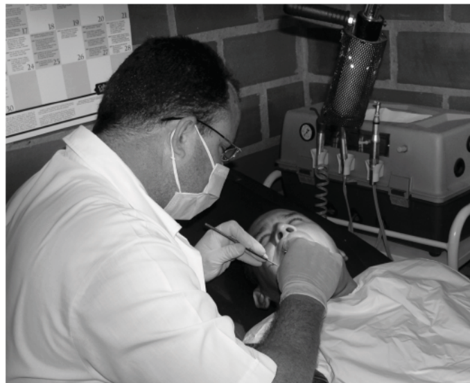
Primary care: cornerstone of Mais Médicos, PIS and Barrio Adentro.