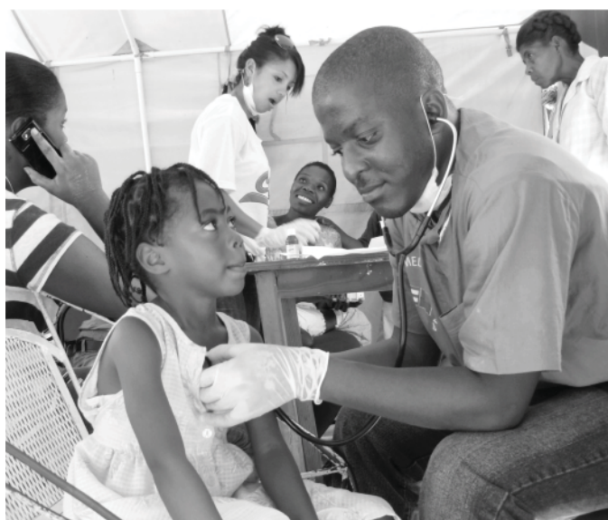
Cuba's Henry Reeve Medical Contingent in Pakistan (2005) and joined by this ELAM graduate in postquake Haiti (2010).

Judging from the available data, US ELAM graduates are also living up to their commitment: as of 2019, of the 182 US doctors trained in Cuba, 92 were in residency or practicing after passing their licensing exams, over 90% of them in primary care specialties. Additionally, 75% serve in Health Professional Shortage and/or Medically Underserved Areas, and nearly all work in the public sector with vulnerable communities.[13]