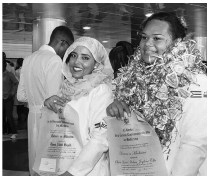
Cuban medical education in South Africa and the Latin American School of Medicine.