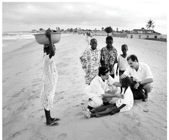
Cuban doctors in Asia, the Amazon and Africa: rough, rural, remote.