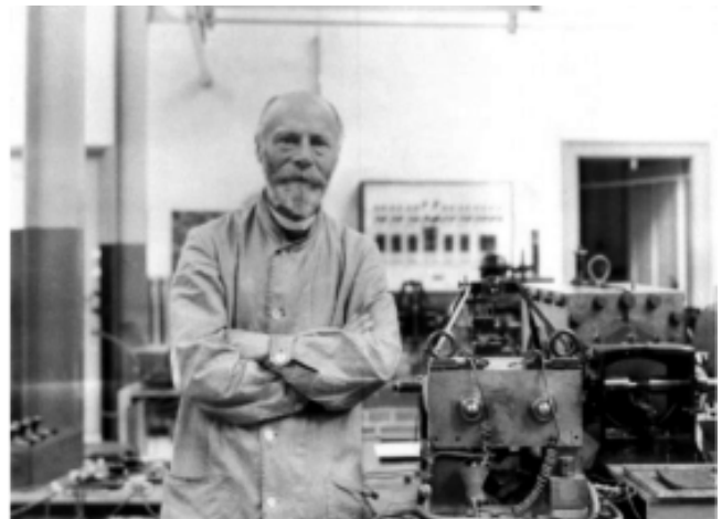
Figure 1. Dr. Willen Einthoven and the first electrocardiograph.

After having decribed the electrocardiogram (ECG) in 1895, Einthoven first recognized in 1903 the U wave and extended the notion of the ECG in a seminal paper published in the Lancet in 1912. Einthoven described the U wave as being of considerable height in pathological cases, but as present also in normal hearts as a wave of small amplitude, present in 50% of all persons. The source of the U wave remained obscure to Einthoven but described two observations. First, the U wave was not of equal height in all hearts. Second, the end of the U wave lies after the second heart sound. 1,2