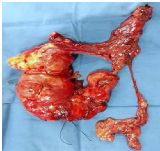
Figure 2: Mediastinal mass after surgical resection.

Mediastinal sarcomas are very uncommon in pediatric age, the most common soft tissue sarcoma is malignant fibrous histiocytoma (24%), followed by liposarcoma (14%). 4