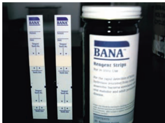
Figure 2. Jar and reactive strips.