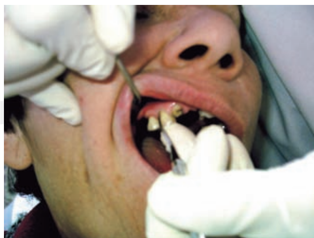
Figura 4. Bacterial plaque sampling.