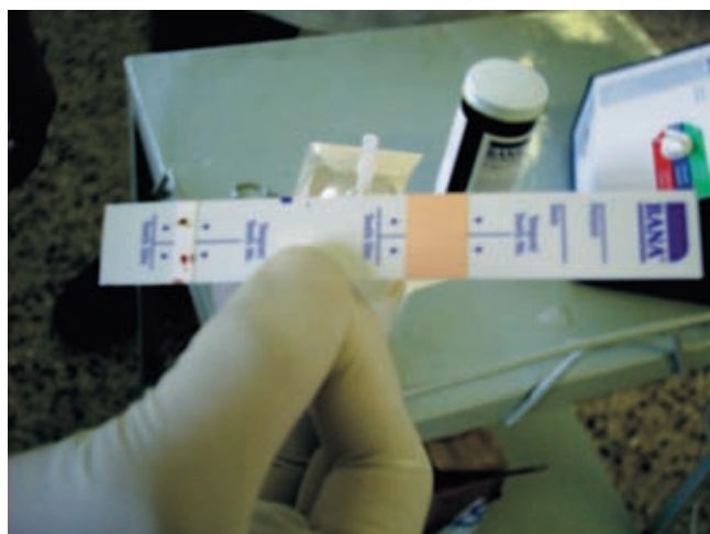
Figure 5. Sample on BANA strip.

In the 10 patient group taken as control with pocket depth of 2 mm, 20 sites proved negative in the BANA Test ( Figure 11 ).