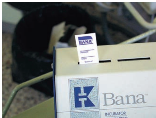
Figure 7. Introduction of sample in incubator