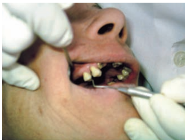
Figure 3. Periodontal probing