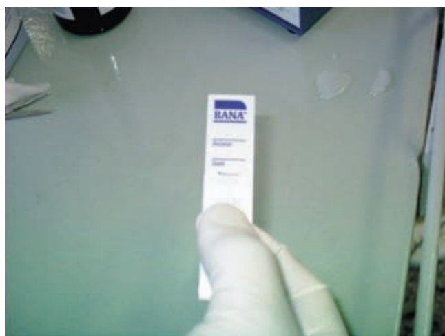
Figure 6. Matrixes union.