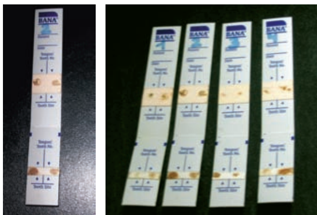
Figures 9 and 10. Reading of strips.