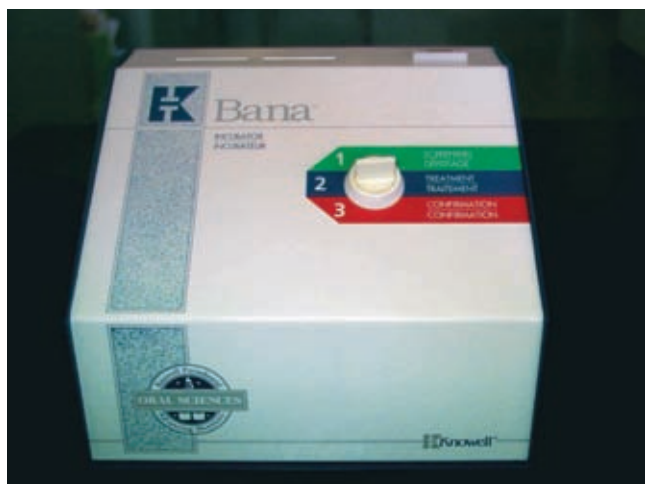
Figure 1. Incubator.

Results were read using the reactive matrix according to W Loesche (Loesche et al, 1990) 9 which are