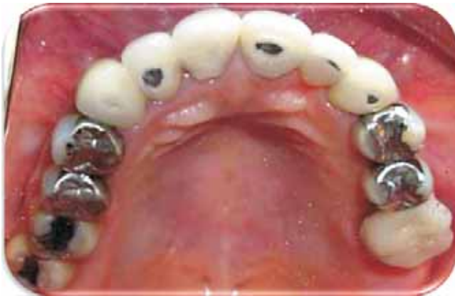
Figure 1. Upper occlusal intraoral view.