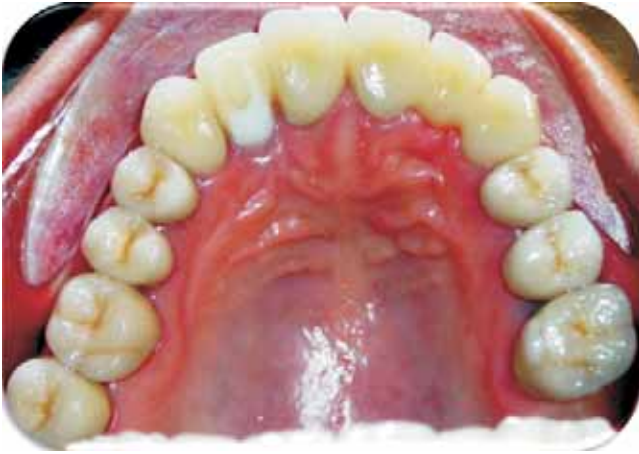
Figure 15. Upper occlusal clinical picture of rehabilitating prosthesis.