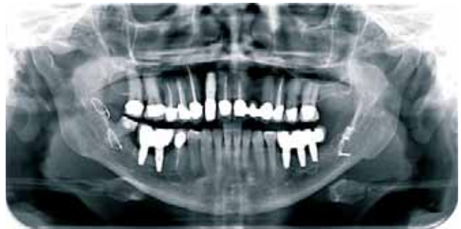
Figure 13. Postsurgical orthopantomography.