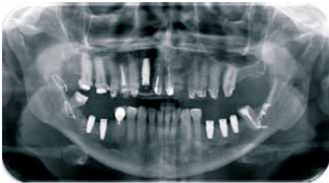
Figure 10. Orthopantomography taken after implant placement surgery.