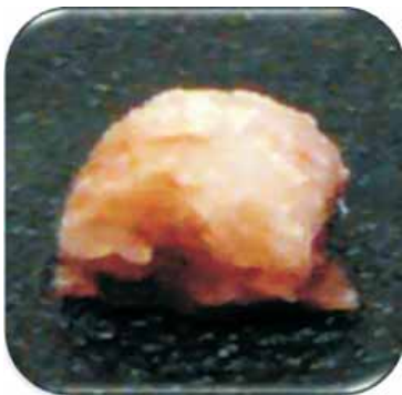
Figure 11. Sample harvested at the stage of implant placement.