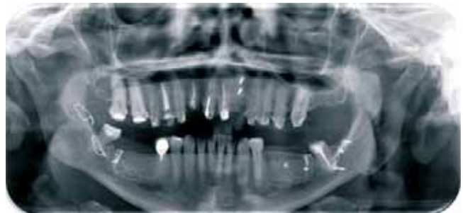
Figure 9. Orthopantomography taken after placement of titanium mesh and xenograft surgery.

the lower jaw, stereolithographic model ridge augmentation was simulated with wax (Figure 8). Following methodology described by Boyne 14 titanium mesh was previously shaped to simplify surgical time. At the site of tooth 22, a pre-formed xenograft block was placed. (Nuk Bone, Biocriss) (Figure 9).