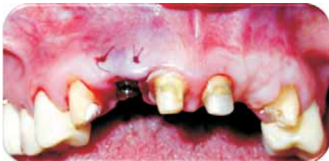
Figure 12. Clinical photograph taken at the stage of implant uncovering I tooth #12 area.

In December 2008 the implant placed in the area of tooth # 22 was uncovered ( Figure 12 ).