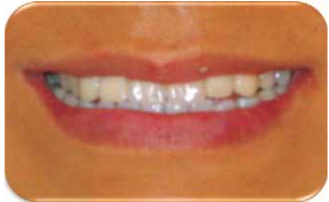
Figure 17. Extra-oral view.

Six months later, implants were put into place; an excellent primary fixation was achieved. At this point, a bone sample was harvested to perform histological studies. In this sample the following could be ob-