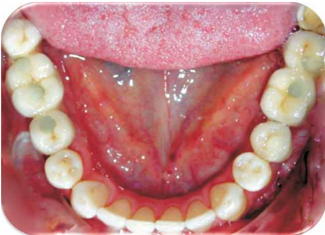
Figure 16. Lower occlusal clinical photograph of rehabilitating prosthesis.

factors was used. 14 Due to the xenograft and allograft osteoconduction properties, a physical matrix was provided for new bone apposition. In this manner, bone volume was preserved during the remodeling process. 16-18 Autografts stimulate osteogenesis around xenograft and allograft particles. 9,18 Pieri mentions the existence of an osteoconductor scaffolding (xenograft) with intraoral autograft. 15 Combination of the aforementioned grafts allows for the reduction of the autograft amount. It thus improves preservation of the graft for a longer time and decreased bone morbidity. 12,19