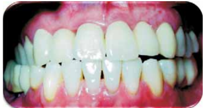
Figure 14. Rehabilitation prosthesis photograph: frontal view.