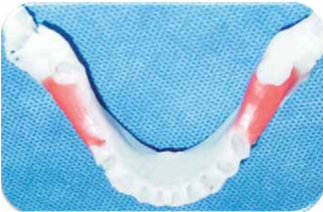
Figure 8. Waxing on stereolithograph model.