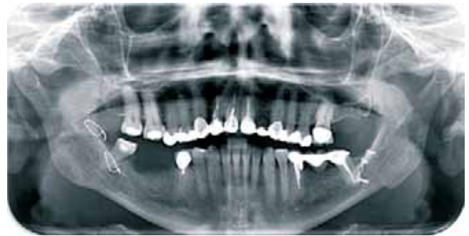
Figure 4. Initial orthopantomography.