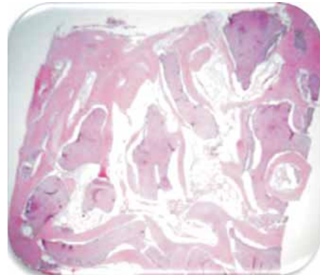
Fig 18. Histological slide of bone sample.

served: basophilic areas of necrotic bone structures, dense and fibrous well vascularized connective tissue. This could be compared with results reported by Artzi, who observed the following in all histological samples taken in cases of titanium mesh ridge augmentation cases: new bone formation, at different maturation and remodeling stages as well as grafted bone particles in direct contact with new bone and connective tissue. 13