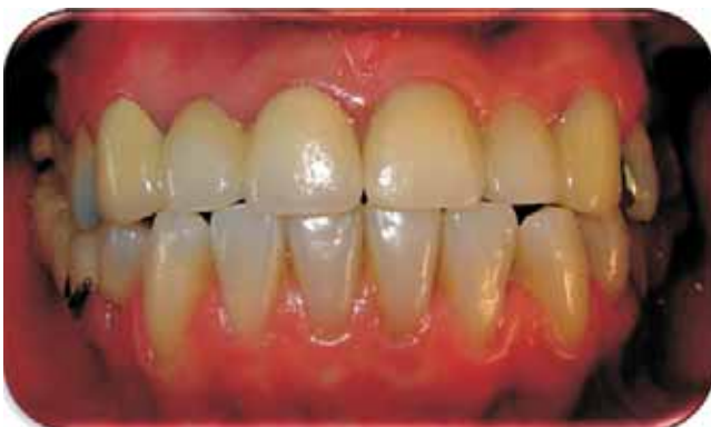
Figure 3. Front intraoral view.