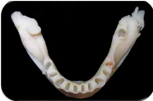
Figure 7. Lower jaw stereolithograph.