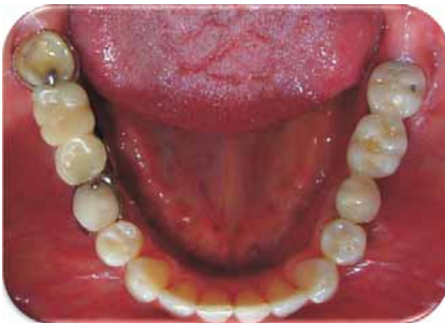
Figure 2. Lower occlusal intraoral view.