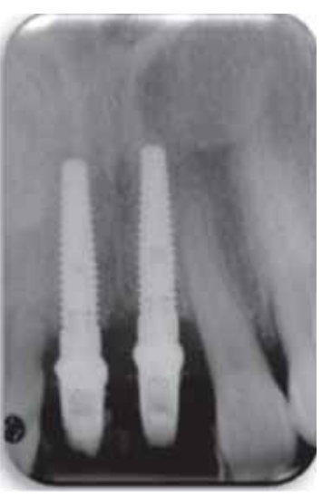
Figure 8. Three months after placement.

take place in immediate load implants. They placed in one patient 11 implants: of those, 6 were immediate load implants and 5 were conventional implants. Two months after placement, histological analyses were conducted which revealed that in conventional implants bone-implant inter-phase was 38.9% while in immediate load implants it was 64.2%.