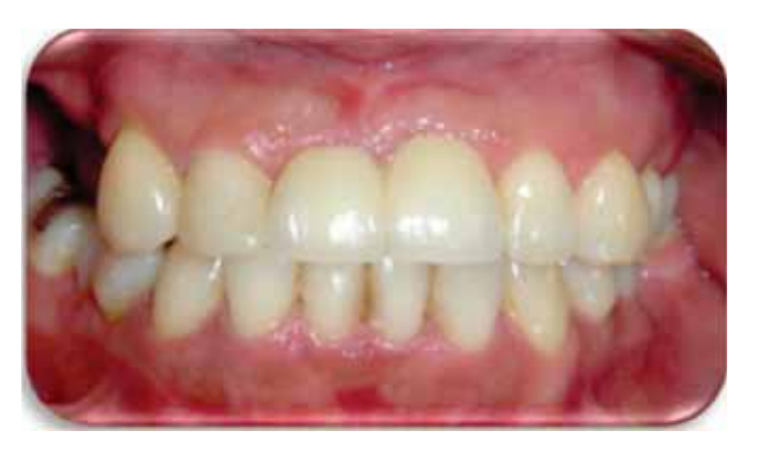
Figure 7. Healing after two weeks.

A week after post-operative control, after placing the implants ( Figure 6 ), the frenulum area suture points were removed since there were no signs of healing alteration in the surgical wound. Healing was deemed adequate. During the two-week post-operative control ( Figure 7 ) almost complete healing of the frenulum