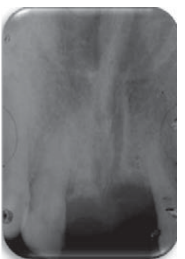
Figure 1. Acceptable gingival tissue is observed. Radiographically, suitable bone density is observed.