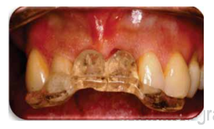
Figure 2. Placement of surgical guide.

mm length in both sites. Parallelism was ascertained ( Figure 3 ). Nobel Replace® Tapered TiU NP 3.5 \times 13 mm implants were placed 3 mm underneath the cement-enamel junction of adjacent teeth in both sites, with a 30 Ncm speed until obtaining desired length ( Figure 4 ).