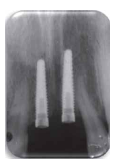
Figure 5. Control dento-alveolar x-ray after implant placement.