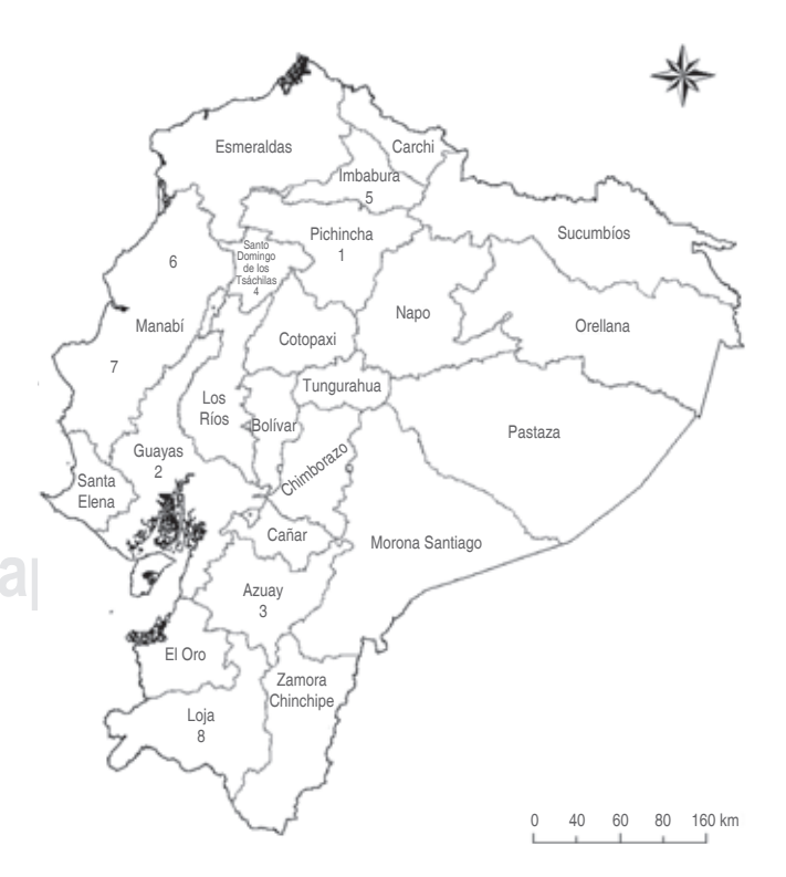
Figure 1: Geographical distribution of the dentist participating in this survey.

A total of 307 dentists accepted to participate in the survey and their distribution by the city of work is shown in Table 1 . Of those, 76.2% graduated from a public university and only 32.9% had a specialist