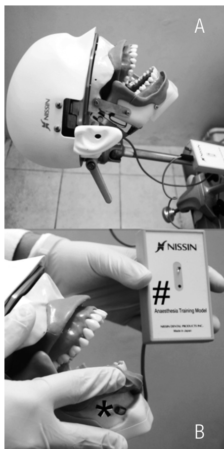
Figure 1. The conduction anesthesia simulation model (CAM) is a typodont with anatomical landmarks including the mandibular ramus. The simulation model is fixed to a phantom head which is then is mounted on the backrest of the dental chair (A). It includes an electronic device (B,#) that produces a signal when the dental needle touches the metallic electronic sensor (B,*).

Table 3 shows the mean scores obtained from the 5-point Likert Scale. A one-way ANOVA test showed significant statistical differences between groups ( p < 0.010 ). Statistically significant differences were noted between G1 and G2 and G1 and G3 with a post hoc test (Table 4).