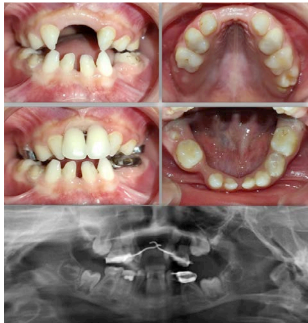
Figure 3. 12 months follow-up: intraoral photographs and panoramic radiograph.