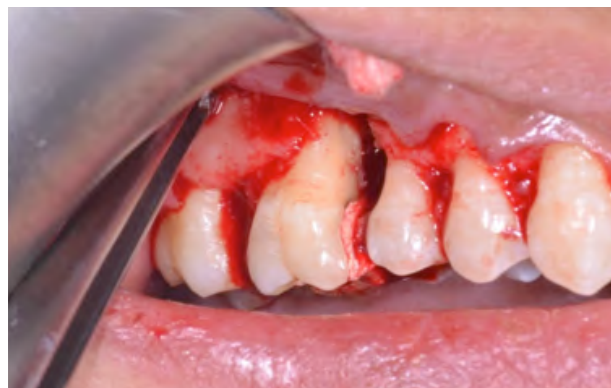
Figure 3. Bony defect exposed.

Matrix Membrane (Surederm) was placed over the graft area to prevent the epithelial cell migration (Figure 5). Finally, interrupted silk (4/0) suture were placed to approximate the soft tissue (Figure 6). Post-operative instructions were given and patient was directed to use chlorhexidine gel and rinse three times for a period of 15 days and suitable antibiotics were prescribed for five days. As the prognosis of tooth was highly questionable patient was recalled on follow up after 1 week, 2 weeks and 4 weeks. After 3-months' patient's intraoral radiograph showed remarkable improvement in regard to bone repair and patient's satisfaction (Figure 7). Clinical evaluation on 3-month, 2-year and 5-year recall exhibited marked reduction in pocket depth up to 12mm with radiographic evidence of further hard tissue repair (Figure 8). A 5-year recall showed a stable probing depth of 3 mm with functionally standing in her oral cavity despite the fact that she refused to have a crown on the treated tooth (Figure 9).