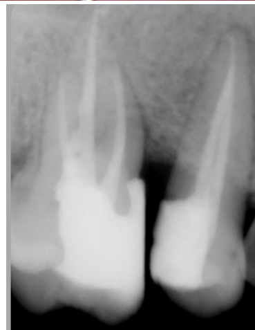
Figure 9. 5-year follow-up.