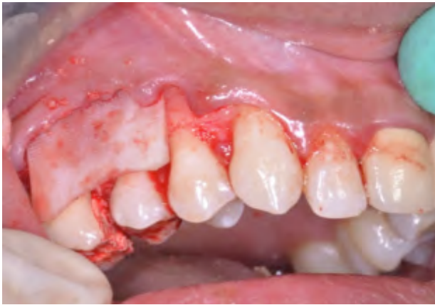
Figure 5. Membrane placed over the graft.