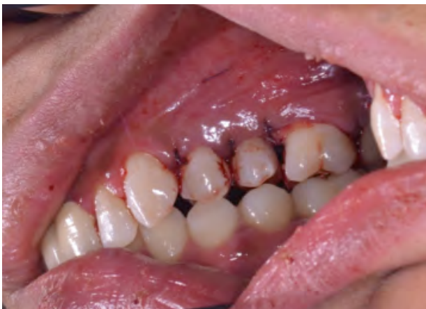
Figure 6. Interrupted silk suture placed.