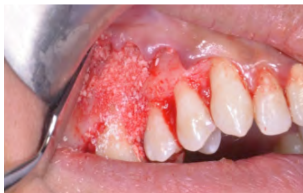
Figure 4. Bone allograft powder condensed.