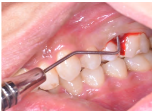
Figure 2. Pocket depth of more than 15mm.

The patient was detailed about the four likely solutions to her problem: