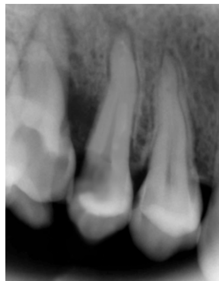
Figure 1. Hard tissue defect at 15 & 16.

A 22-year old female patient presented in our private dental practice set up with complaint of pain, food stagnation, foul smell and loosening of couple of teeth in upper jaw. Intraoral examination revealed vertical bone loss around distal surface of upper right second premolar and mesial surface of first molar (Figure 1). The pocket depth was measured to be more than 15mm (Figure 2). The severely affected premolar and molar, on pulp testing showed pulpal involvement leading to diagnosis of endo-periodontal lesion.