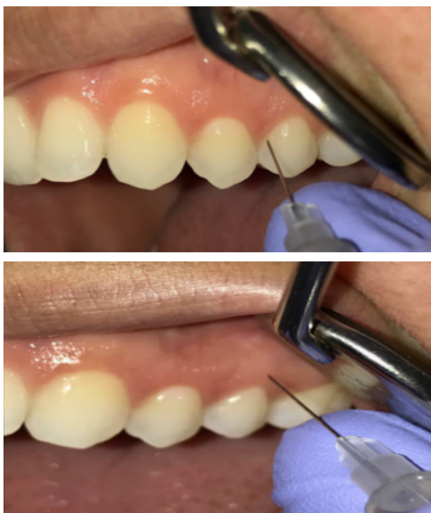
Figure 2: Intraoral sites of infiltration- interpapillary 24/25 and attached gingiva.

In the second follow-up 4 months later, the patient reported a 50% improvement after the applications of botulinum toxin together with 50 mg of Topiramate daily. It was decided to re-apply the botulinum toxin, but the dose was increased to 150 units in 6 different intraoral sites (interdental papillae from canine to first molar by vestibular and attached gingiva of 24/25 teeth.) One month after the application, the patient reported an 90% improvement, feeling satisfied with the results.