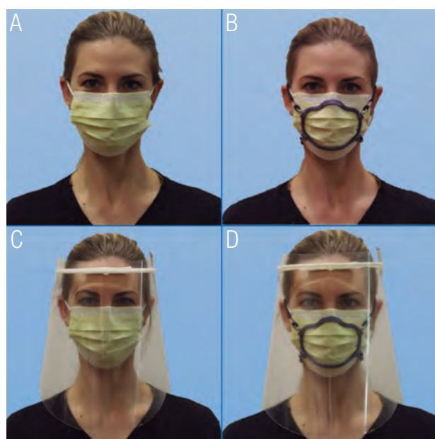
Figure 1. Different scenarios of the sample characterization. A=Group 1: mask only (M); B= Group 2: Mask+frame (MF); C= Group 3: Mask+face shield (MFS); D= Group 4: Mask+frame+ face shield (MFFS).

perioral region; featuring 4 side holes, 2 on each side, for placement of elastics to fit the users' head and neck. Details and specifications of the frame production are provided in a previous study (14). The printing time of each PPE was approximately 1.5 hours using the SprintRay Pro 95, at a cost of roughly $2.00 in resin material plus the cost of labor. Figure 1 illustrates the frame fitted to the commercial ASTM level 1, 2, 3 medical face mask (GCPYE, Crosstex) and the face shield used in the present study. The recommendation for cleaning/disinfecting the frame and face shield followed the manufacturer's recommendation.