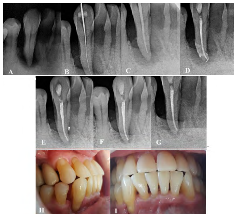
Figure 3. A: Element 43 with an extensive lesion; B: Working length; C: Master cone test; D: Obturation and final radiograph; E: 6-month follow-up; F: 12-month follow-up; G: 18-month follow-up; H and I: Current clinical photograph after endodontic and periodontal treatments.