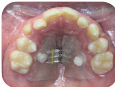
Figures 3 and 4.

Shows the insertion sites for the microscrews and the acrylic plate. The plate is placed separate from the crowns of the posterior teeth crowns to avoid dentoalveolar compensation movements.