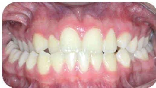
Figures 1 and 2.

The diagnosis should not be limited to the clinical aspect but also the radiographic one, in which the transverse skeletal relationships of the maxilla and the mandible should be measured. Itate niae volesti