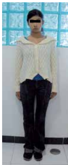
Figure 2. Photographs of the patient's posture.

psychotherapy, orthodontic appliances and surgical treatment.