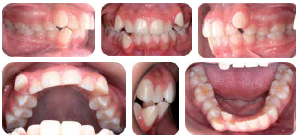
Figure 3. Initial intraoral photographs.

Female patient of 13 years of age with very strong painful symptoms and generalized muscular hypertonicity, vertigo, inability to walk, limitation of mandibular movements, weak chewing and maximum oral opening of 17 mm ( Figures 1 and 2 ). She was referred from Neurology, and her reason for consultation was to eliminate the pain. Cefalometrically, she presented a skeletal class II due to retrognathism, micrognathia, a tendency to horizontal growth, bi-proclination and dentoalveolar bi-protrusion. Facial analysis showed a convex