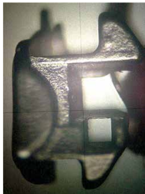
Figure 2. Bracket In-Ovation®.

Cash et al observed that all the slots in the brackets they examined were increased from 5 to 24%, which was the most comprehensive variation. In our study, we found that all self-ligating brackets have slots with larger dimensions than the ideal (0.022"); the bracket