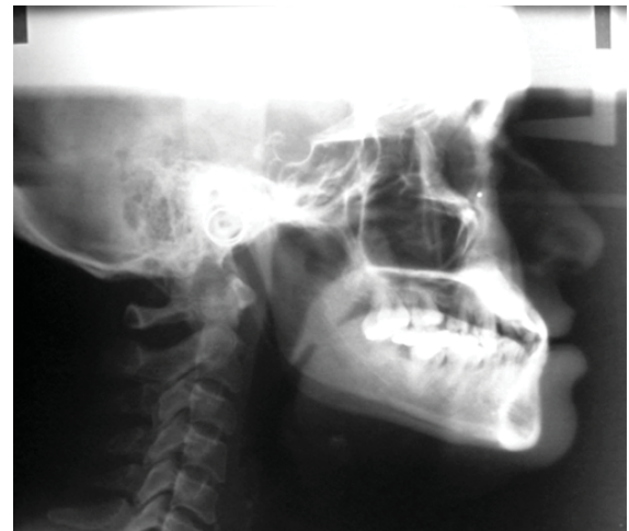
Figure 4. Initial lateral headfilm.

profile; canine guidance was achieved by means of prosthetics. Bilateral molar class I was also obtained as well as coincident midlines, improvement of the smile, a positive overjet and overbite, periodontal health and occlusal function.