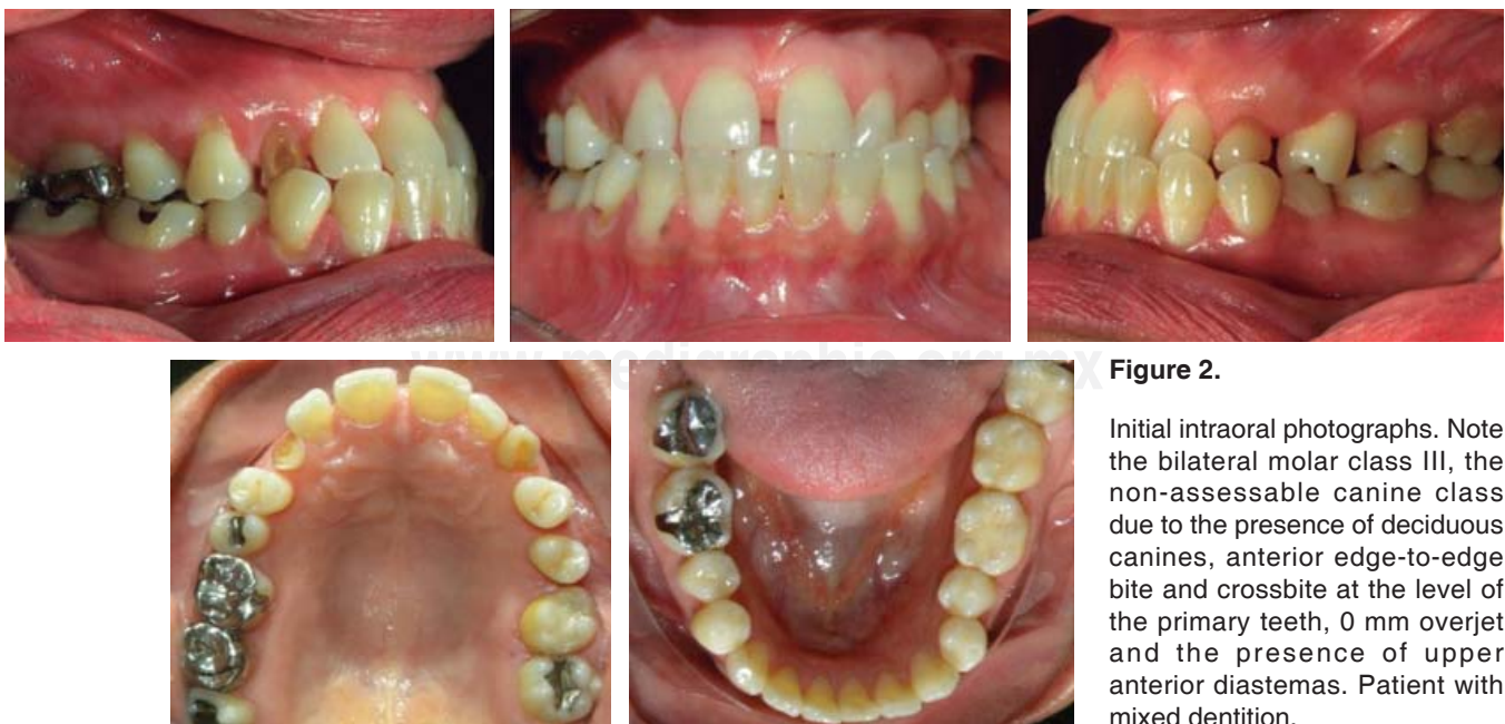
Figure 2. Initial intraoral photographs. Note the bilateral molar class III, the non-assessable canine class due to the presence of deciduous canines, anterior edge-to-edge bite and crossbite at the level of the primary teeth, 0 mm overjet and the presence of upper anterior diastemas. Patient with mixed dentition.

Through this treatment an improvement in the maxillo-mandibular relationship was obtained, giving proper projection of the lips and improving the