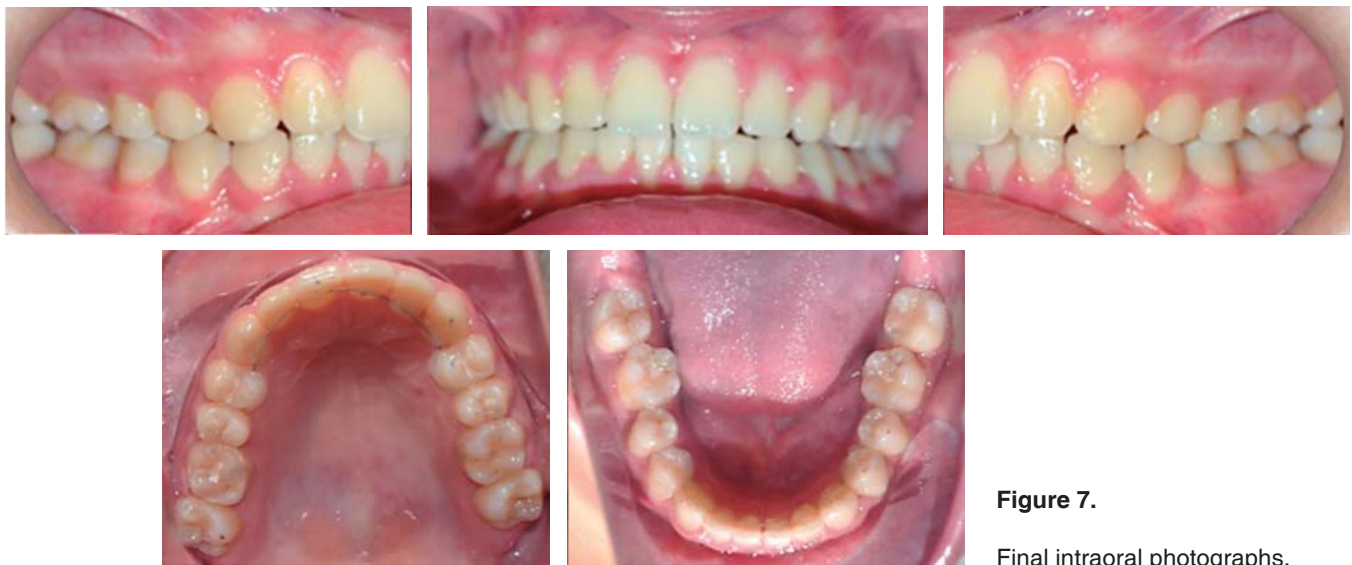
Figure 7. Final intraoral photographs.

resulting in root parallelism and reducing undesirable movements.