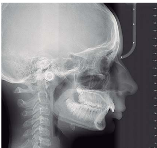
Figure 3. Initial lateral headfilm.