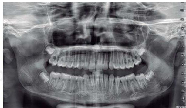
Figure 4. Initial panoramic radiograph.

In the final panoramic X-ray end an acceptable root parallelism may be observed. Upper and lower fixed retention was placed ( Figures 6 to 9 ).