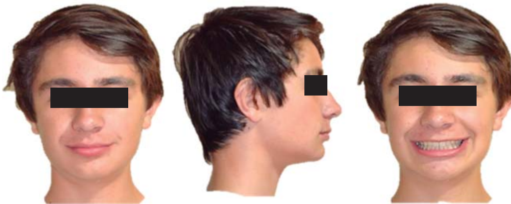
Figure 6. Final facial photographs.