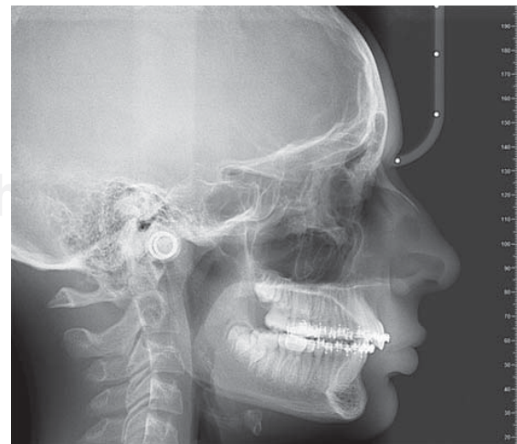
Figure 8. Final lateral headfilm.

Performing a correct diagnosis will result in an effective treatment plan guiding the specialist to take a wise decision for the benefit of the patient. In this case,