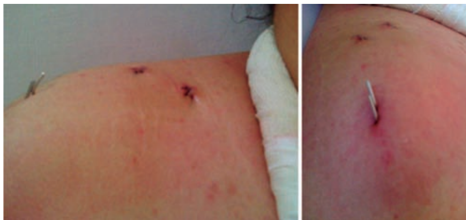
Figure 5. Patient at postoperative day 2.