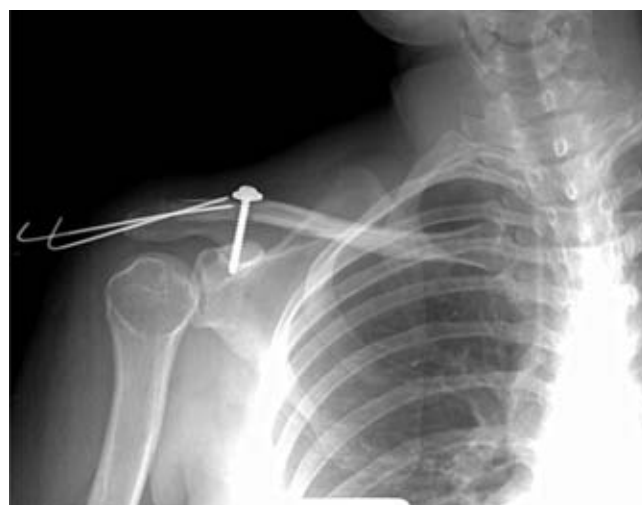
Figure 4. Radiologic result with the MIS technique.