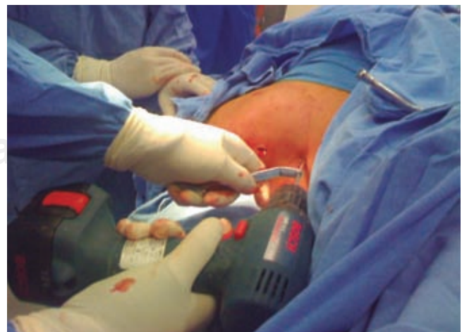
Figure 2. Drilling from the clavicle to the coracoid with a 3.2 mm drill bit.