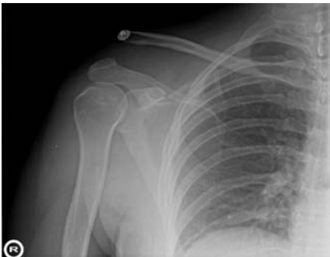
Figure 1. Grade III acromioclavicular dislocation.

At weeks 10 and 14 the ranges of motion were assessed and home rehabilitation was continued. If the patients'