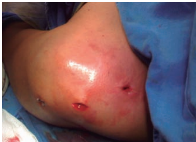
Figure 3. Approaches in the MIS technique.

The predominant side of injury was the right side, which accounted for 66.6% ( n = 28/42 ) of the cases. No added lesions were seen upon admission in 71.4% ( n = 30/42 ); 14.2% ( n = 6/42 ) had head trauma; 11.9% ( n = 5/42 ) had a fracture elsewhere in the body, and, finally, one patient, or 2.3% ( n = 1/42 ), had a mixed injury characterized by grade