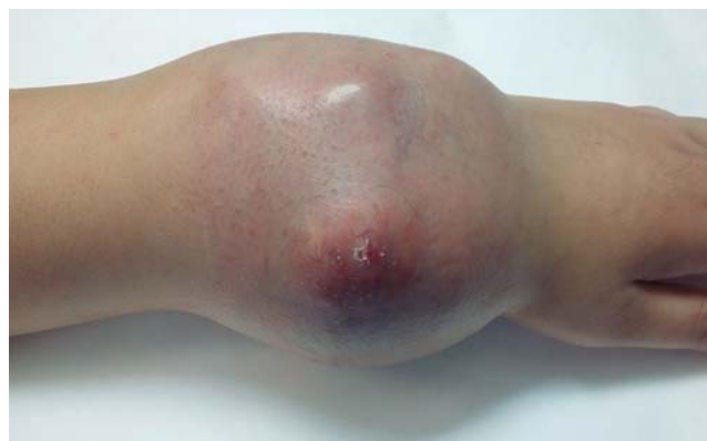
Figure 2. Clinical appearance of the lesion.