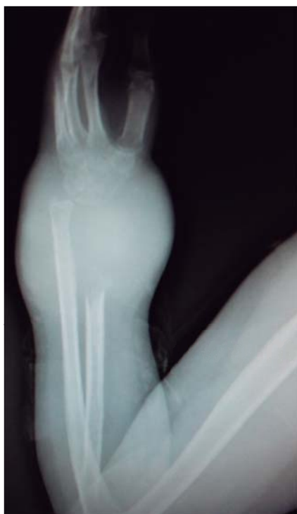
Figure 1. X ray showing a lytic and destructive lesion (phantom bone sign) in the distal radius consistent with a giant cell tumor.

Since its initial description, the anterolateral thigh flap has gained popularity in its use as a flap of soft tissue for reconstruction of regional and distance defects. 15