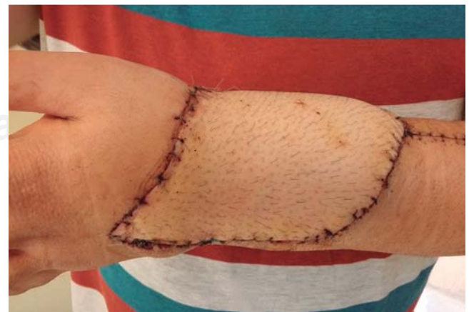
Figure 6. Final clinical appearance.