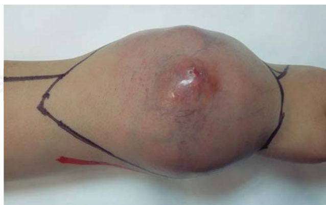
Figure 3. Layout of the area for resection and the path of the radial neurovascular bundle.