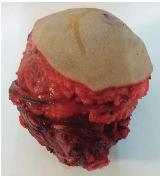
Figure 4. Surgical specimen product of wide resection.

Prior identification trough vascular Doppler of the radial neurovascular package and measurement of dimensions of the skin to be included in the surgical specimen, tissue is then drawn and then approached including a spindle