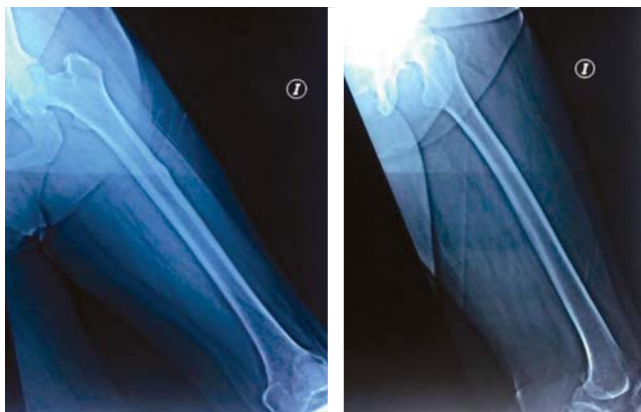
Figure 2: Anteroposterior and lateral radiograph of the left femur, showing incomplete atypical fracture with proximal lateral cortical thickening.