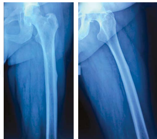
Figure 4: Anteroposterior and lateral radiograph of left femur, showing decrease of proximal lateral cortical thickening.