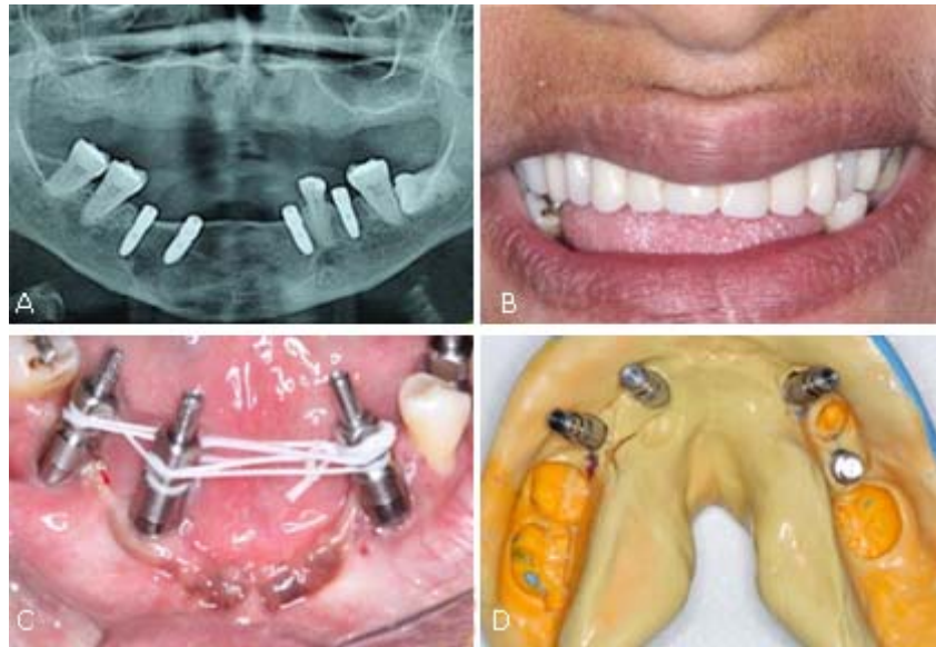
Fig. 2 - A: Panoramic Radiograph with implants installed. B: With the old complete denture the smile was unsatisfactory. C: Abutments and transfers. Subsequently the transfers were united with the acrylic resin (Duralay, Reliance Dental Mfg., USA). D: Addition silicone mold.

after a time to the surgery clinic for extraction of the molar retained in the mandible. After approximately 5 years of tumor removal, there was no recurrence of the lesion. In addition, there were no signs of peri-implant and/or periodontal diseases, evidencing the success of the treatment.