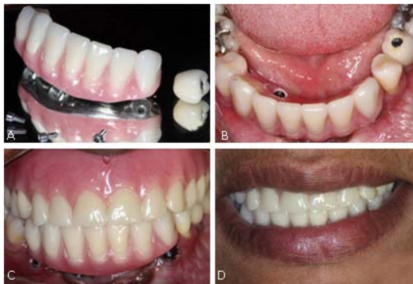
Fig. 3 – A: Implant-supported prostheses. B: View of the mandibular arch with the implant-supported prostheses . C: Prostheses installed. D: Smile.