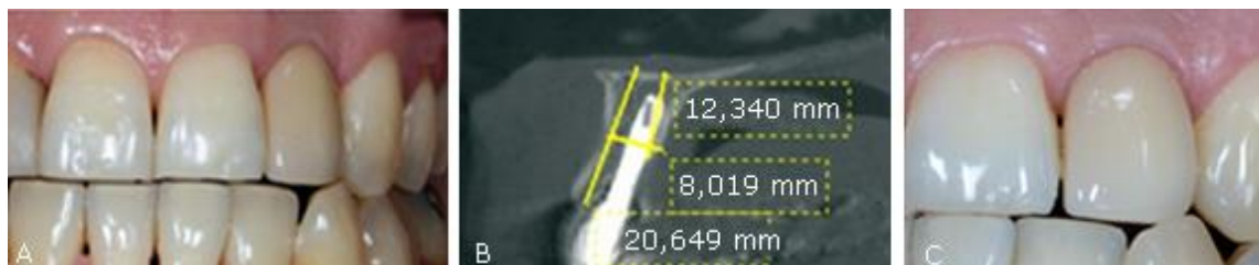
Fig. 3 - A: Six months after the implant placement. B and C: Radiographic and clinical follow-up after two years.

Radiographic and clinical follow-up after two years showed a favorable evolution of the implant. No mechanical or biological complications were seen throughout this observation period. The buccal and palatal gingival margin are in a correct position and there was a vertical bone gain of approximately 2 mm. (Fig. 3, B and C).