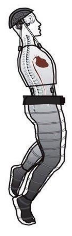
Fig. 2. Schematic of wearable LBNP-device. LBNP is generated from a portable vacuum powered by a battery. In addition to generating blood and fluid shifts towards the feet, mechanical forces are also generated by the vacuum. The negative-pressure trousers are attached to a vest and a cap to distribute the mechanical loads to the entire axial system. Use does not interfere with daily activity in space. Duration is limited by battery lifetime. (Petersen et al unpublished, with permission).

LBNP (Fig. 3) to provide an integrated countermeasure. These concepts address the primary mechanisms of space-flight deconditioning due to loss of hydrostatic pressures within fluid columns of the body, cerebrospinal fluid and lymph, loss of body weight and greatly-reduced mechanical loads, decreased sensory inputs, and altered Starling or transcapillary pressures. Previous research documents that LBNP is effective to protect many other physiologic systems that are affected by microgravity.