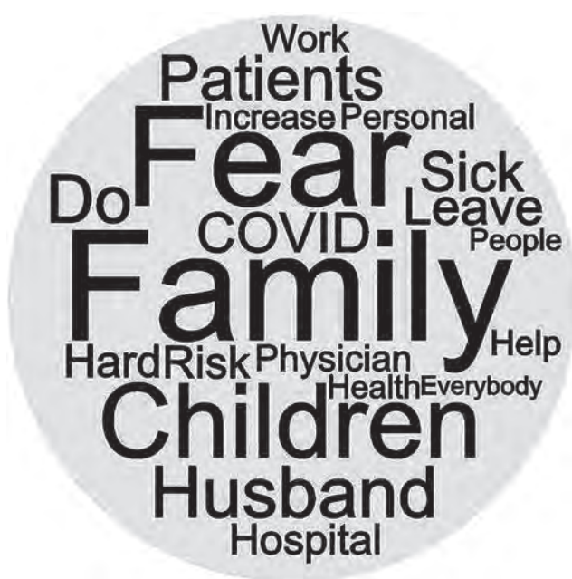
Figure 1. Wordcloud of the 20 most frequently found words in the content analysis of the participants’ responses.

Participants’ commentaries showed that in part, the distress was caused by an absence of sensitivity and understanding by the authorities, who lacked strategies for easing the labor (paid and unpaid) put on women’s shoulders during this pandemic.