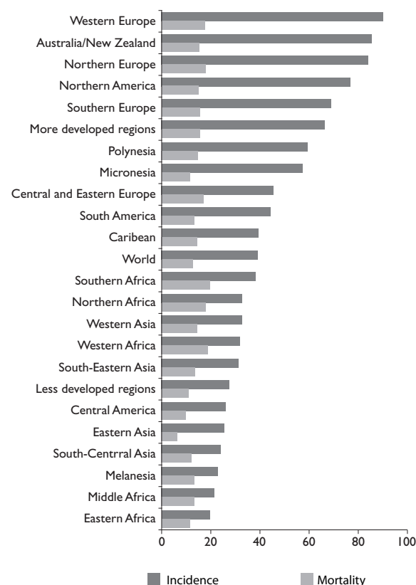
FIGURE 2. BREAST CANCER INCIDENCE AND MORTALITY BY REGION IN 2008. ESTIMATED AGE-STANDARDISED RATES (WORLD) PER 100,000 1

Figure 2 shows the range of estimated age-standardised incidence and mortality rates by region of the World in 2008. Western Europe and Eastern Africa are the regions with the highest and lowest incidence (89.9 and 19.3 cases per 100 000 women, respectively). South America and the Caribbean are in an intermediate range (44.3 and 39.1 cases per 100 000). Central America and most regions of Asia and Africa are in the moderate to low range of incidence (<40 cases per 100 000). All too frequently, however, regions with moderate to low incidence are saddled with mortality rates similar to or exceeding that of Western Europe (17.5 deaths per 100 000 women). This applies, for example to: Southern, Western and Northern Africa (19.3, 18.9 and 17.8 deaths per 100 000, respectively). The age-standardised mortality rates in South America and the Caribbean are somewhat lower (13.2 and 14.2 deaths per 100 000). Common to all of these regions is a much less favorable relationship between incidence and mortality (approximately 2:1 in the above regions in Africa, and