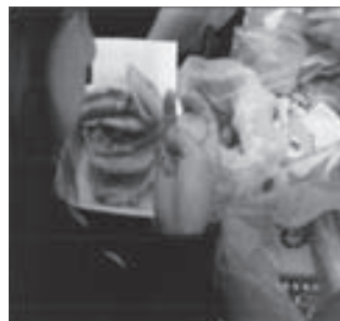
FIGURE 1. PHOTO VOICE EXAMPLE