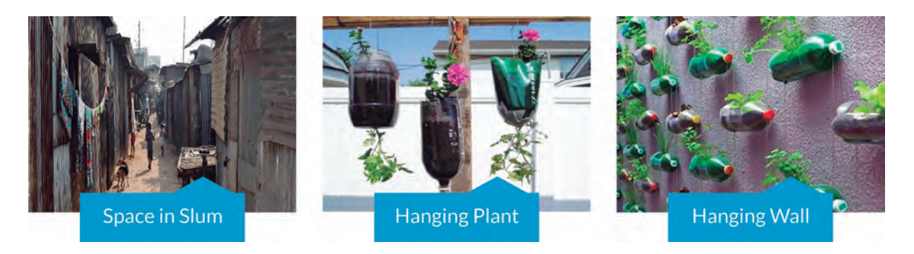
FIGURE I. HANGING WALL VEGETABLE GARDENS WITH DISPOSED PLASTIC BOTTLES NUTRITION TO PROVIDE ES-SENTIAL DIETARY NUTRITION WITHIN HIGHLY CONGESTED SLUM SETTLEMENTS. BANGLADESH

As a teacher, and for all of us involved in this process, this was quite an emotional experience, and personally and intellectually rewarding. The earlier stress of how this would unfold ultimately turned to joy and deeper realization that I could and did learn from students about simple solutions that can actually be applied to disadvantaged communities. Despite all