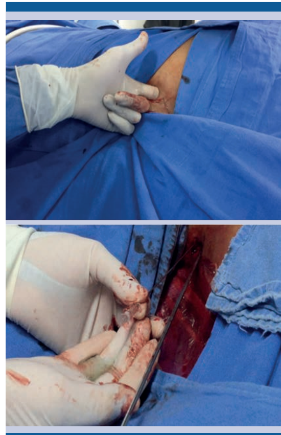
Figure 3. Renal puncture under fluoroscopic guidance through the digital tract with urine collection.

opacification ( Figure 3 ). Urine was then assessed to confirm proper puncture, and a Sensor™ guidewire (PTFE-Nitinol Guidewire with Hydrophilic Tip) was introduced into the ureter, with subsequent sequential dilation of the tract with Amplatz dilators up to 30-Fr in diameter ( Figure 4 ). A 26-Fr nephroscope (KARL STORZ GmbH & Co. KG) was introduced, and pneumatic lithotripsy with