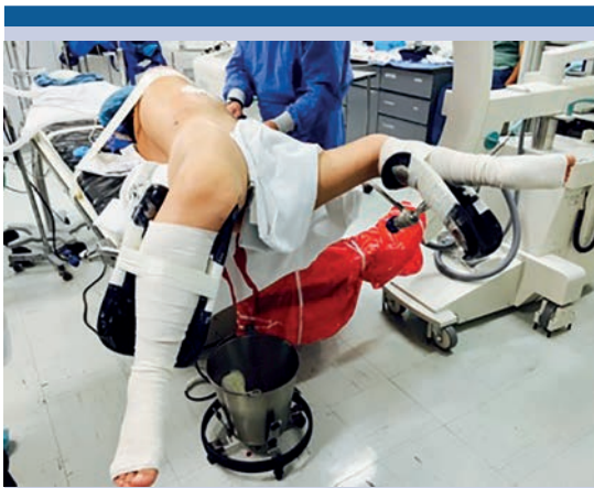
Figure 1. The modified Valdivia position.

16-Fr Foley transurethral catheter placement and a retrograde pyelogram. The distance between the last rib and the iliac crest was measured, achieving subcostal renal access through the posterior axillary line. An incision of approximately 1.5 cm and digital dissection of all layers of the anterolateral abdominal wall was made until the retroperitoneum was reached, forming a tunnel through which the renal unit was finally palpated ( Figure 2 ). A puncture under fluoroscopic guidance (C-arm in a 90-degree fixed position) was made with a Chiba 22 G needle (Cook Medical Inc) at the level of the lower calyx, facilitated by distension with saline injection and contrast medium through the ureteral catheter with renal