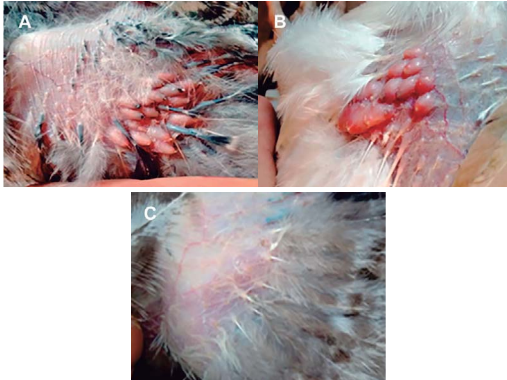
Figure 3. Photographs of the thigh region of eight-week-old turkey chicks from the three treatment groups after being challenged through an excoriation with a turkeypoxvirus isolate. A) Control. B) Heterologous vaccine. C) Homologous vaccine. Lesions consistent with a pox infection can be seen in A and B. No post-challenge lesions are observed in photograph C.